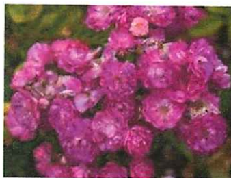
Baby Faurax (Polyantha)